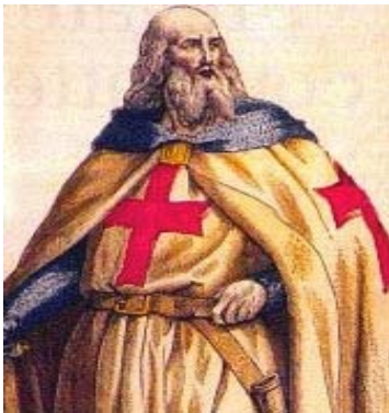
Jacques de Molay